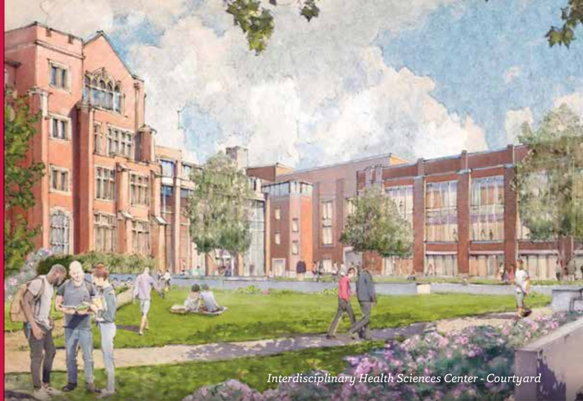
Interdisciplinary Health Sciences Center - Courtyard