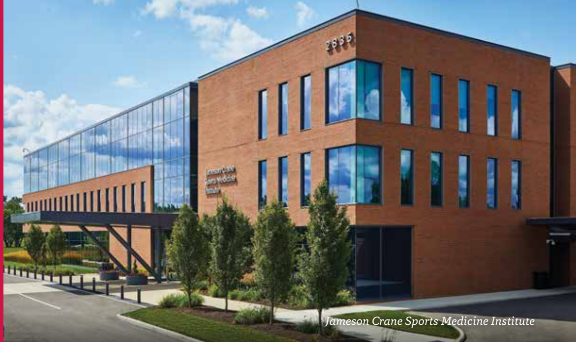
Jameson Crane Sports Medicine Institute