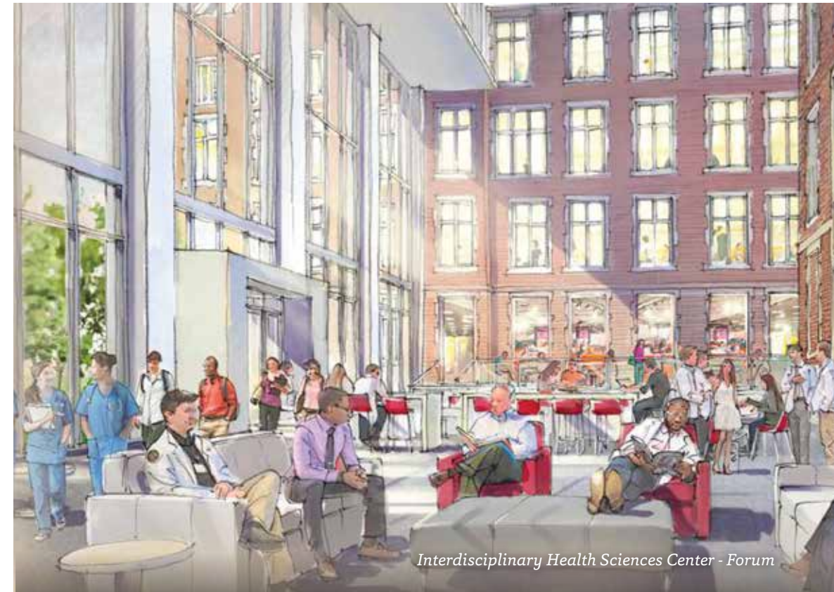
Interdisciplinary Health Sciences Center - Forum

This plan includes new outpatient care centers around the I-270 outerbelt, in Dublin, Powell and northeast Columbus, as well as a new care facility on The Ohio State University's West Campus.