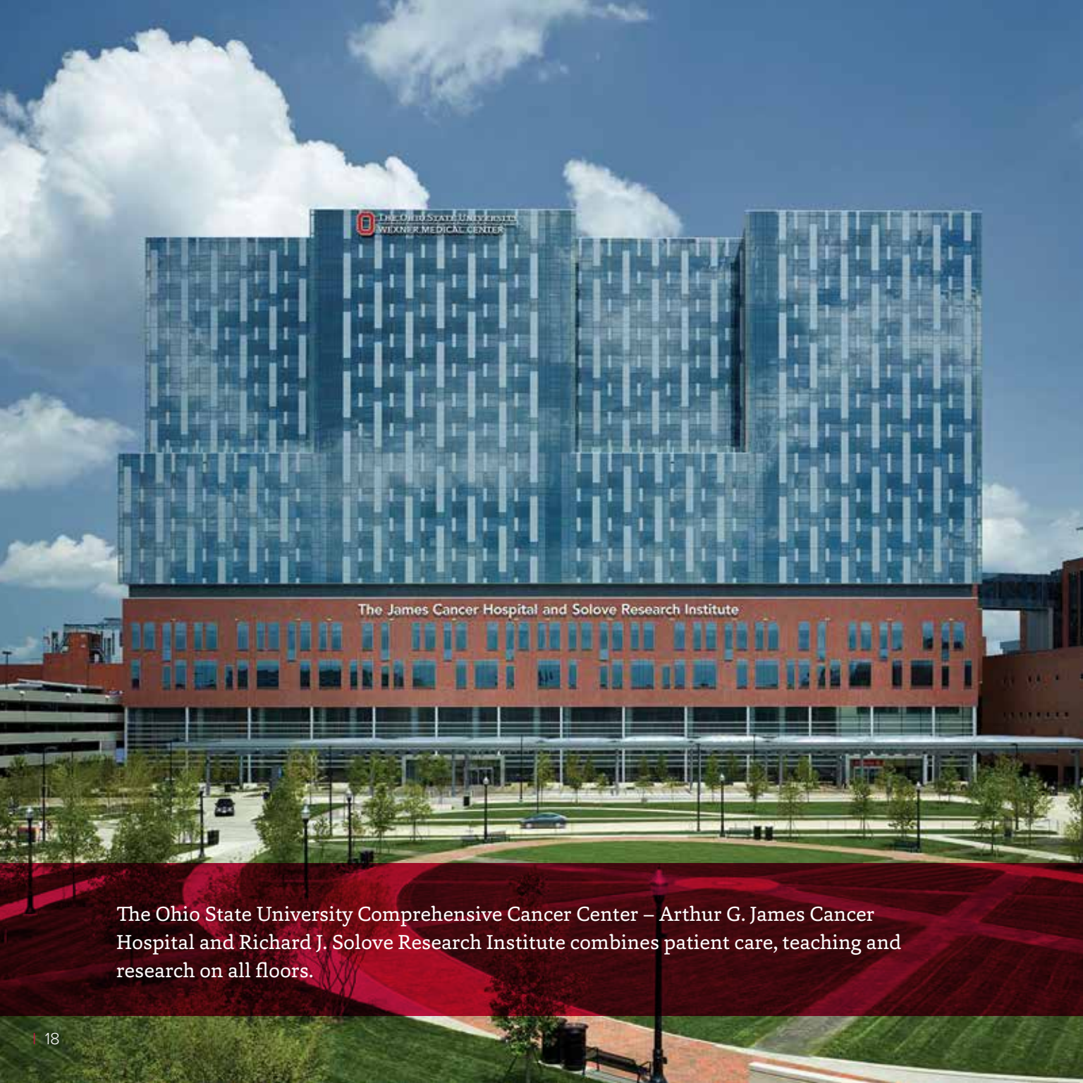
The Ohio State University Comprehensive Cancer Center – Arthur G. James Cancer Hospital and Richard J. Solove Research Institute combines patient care, teaching and research on all floors.